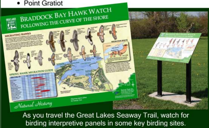
As you travel the Great Lakes Seaway Trail, watch for birding interpretive panels in some key birding sites.

5. Eastern Lake Erie: This region is heavily urbanized, yet excellent birding opportunities are available on preserved lands and redevelopment lands where restoration has occurred.