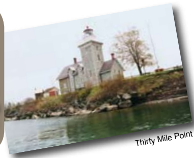
Thirty Mile Point