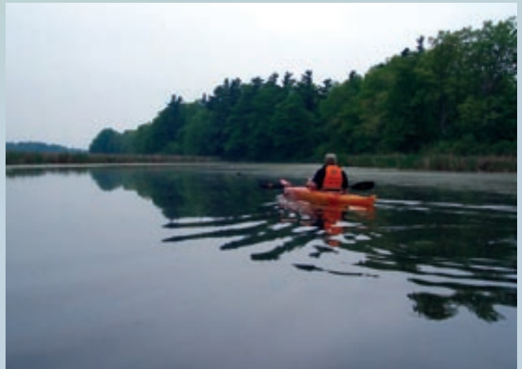
French Creek, 1000 Islands