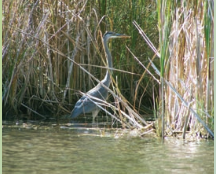
Grey Heron

Directions: The upstream parting site is the DEC Harlem Road Access site, located on Harlem Road between Clinton Street and Mineral Springs Road. The downstream access point is the DEC Ohio Street Access site.