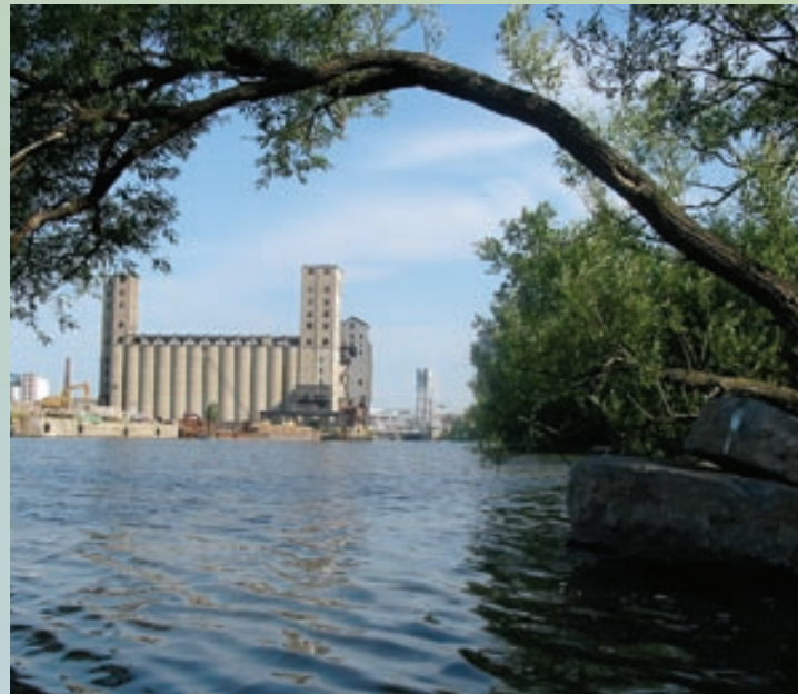
Buffalo River Urban Canoe Trail