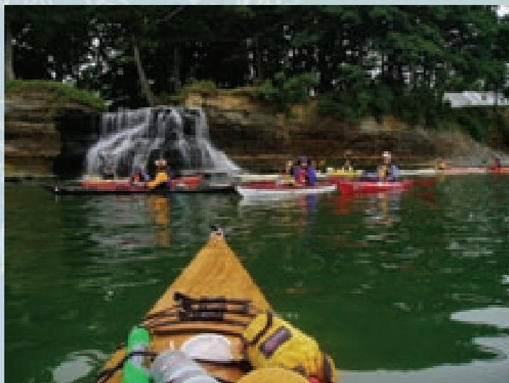
Paddling at Four Mile Creek entrance to Lake Erie

Presque Isle State Park is a seven mile long peninsula projecting into Lake Erie. The park offers many places for paddling in sheltered water and on calm days, on the bay and lake. The lagoon area of the peninsula offers the best